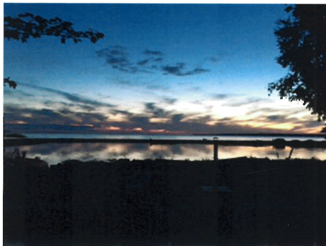
Lake Superior Sunset